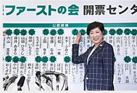
東京の会 開票センター Tokyo gov's political movement spawns national clone