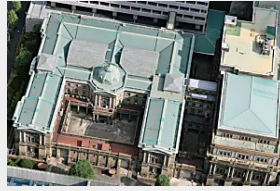
Japan Market Pulse: BOJ steps in where foreign investors fear to tread