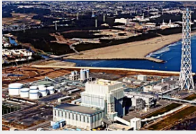
Obstacles grow for coal power in Japan