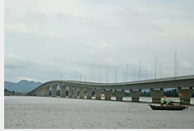
Hanoi makes sharp U-turn on Japan-built bridge