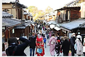
No vacation without taxation